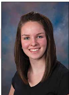
Class of 2011 Salutatorian