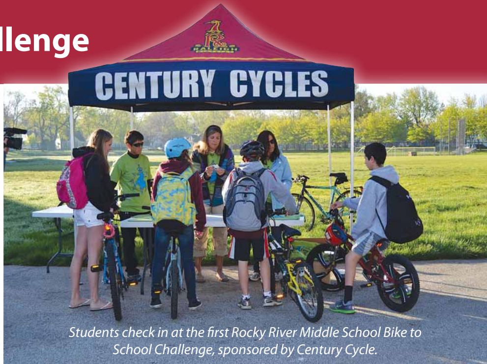
Students check in at the first Rocky River Middle School Bike to School Challenge, sponsored by Century Cycle.

Rocky River Mayor Pamela Bobst attended the assembly, praising the students for their bicycling accomplishments and telling them how much they've inspired their communities. Mayor Bobst said that the Old Detroit Streetscape project will have new bike racks, and she encouraged the students to bicycle all summer to their destinations.