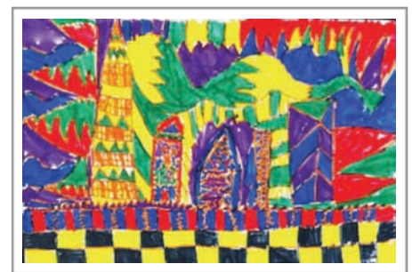
Goldwood Primary School's Second Grade Line Art Drawings